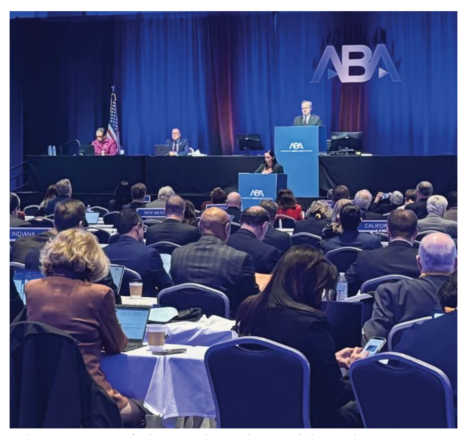
Author urges ABA House of Delegates to adopt Resolution 500 (Feb. 5, 2024).

With criminal cases taking precedence for courts' resources, over one million civil cases have been added to California courts' backlog in the last five years.<sup>4</sup> Yet the civil case backlog is not something that was simply created by the pandemic. The problem started long before and continues to worsen. California unlimited civil case filings have exceeded dispositions since 2013.5 In each of the last three years, the number of unlimited civil cases filed were more than double the number of unlimited civil cases disposed.<sup>6</sup> In 2023, the unlimited civil clearance rate (the number of outgoing cases as a percentage of incoming cases), which should have been 100 percent, was only 42 percent. The standards of judicial administration establish case processing time to disposition goals for different types of civil cases.8 For unlimited civil cases those goals are: 100 percent disposition within 24 months, 85 percent disposition within 18 months, and 75 percent disposition within 12 months.9 Last year, not surprisingly, California courts did not meet any of these case processing time goals for unlimited civil cases.<sup>10</sup>